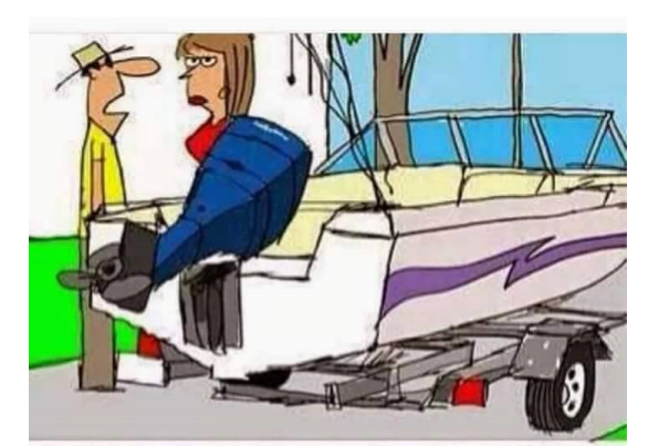
"What do you mean I never take you anywhere nice? Last week I took you to a bait & tackle show, and today we're going to a boat show."

March15—18 Ultimate Fishing Show: DeVos Place, Grand Rapids MIchigan